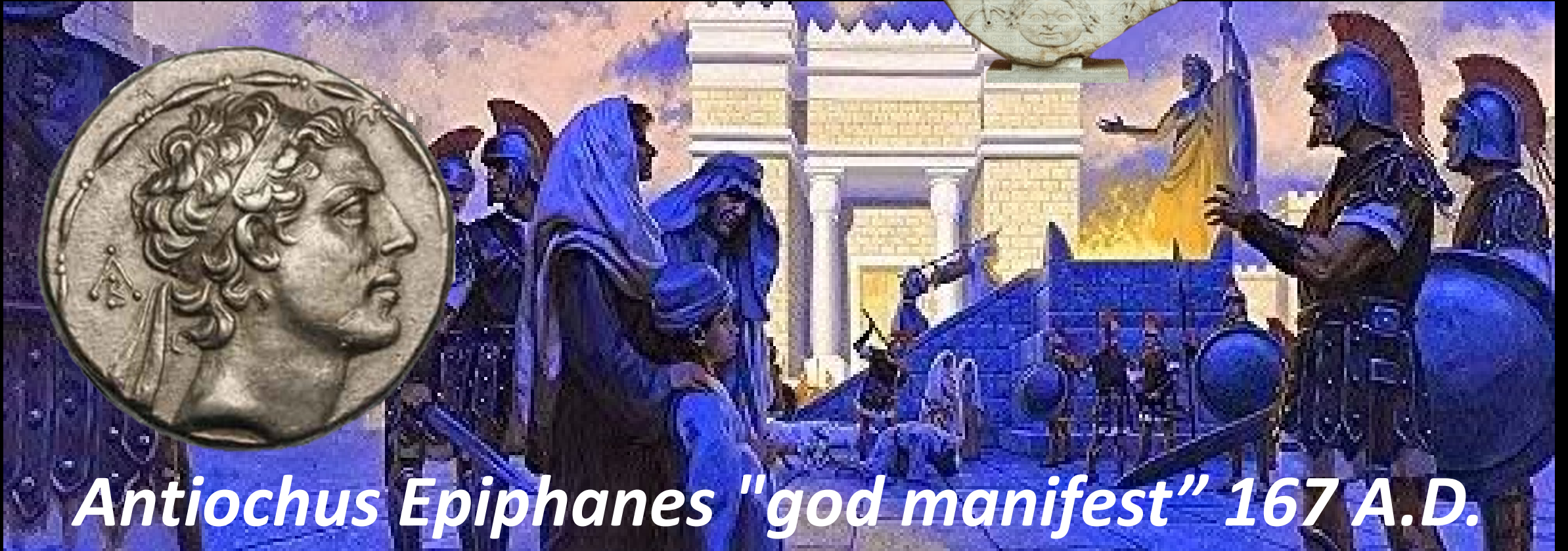
Antiochus Epiphanes "god manifest" 167 A.D.